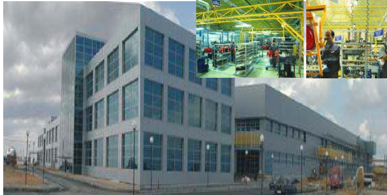
Alarko Carrier Industrial Facilities Gebze - Turkey